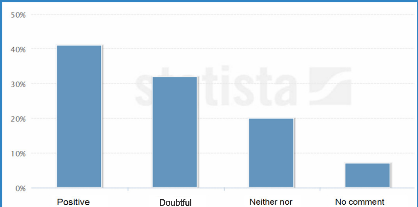
Image 3: general adjustment about using home networking in Germany in the year 2010 3 .

In Germany, 1048 persons in the age of 18-69 were asked about their opinion by Waggener Edstrom. As shown in the statistic more than 40% of the polled people which is the relative majority have a positive opinion towards home networking. 30% have a more doubtful opinion towards it which is the minority.